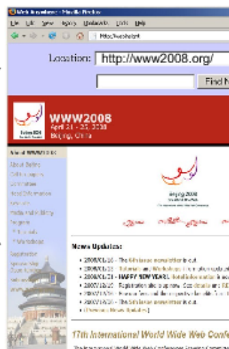
Figure 1: WebAnywhere is a web browser that runs as a web application inside the existing web browser. It requires no special software to be installed or permissions to run, so it can provide custom interfaces wherever users happen to be. ( http://webanywhere.cs.washington.edu/beta )

WebAnywhere Content Frame → Loads web content via proxy server. Browser frame speaks the web content loaded here.