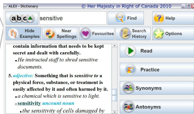
Figure 1: The main interface and features of ALEX©.

ALEX© is designed to help develop language skills and knowledge acquisition pertaining to real life by providing intuitive access to various language-based tools, as shown in Figure 1. Furthermore, it helps students develop other essential skills in conjunction with literacy skills, such as computer usage and information-focused thinking. ALEX©'s aim is to increase students' independence, to empower learners outside of a classroom, and to adapt to and meet different needs of different learners. It is a useful assistant not only for students, but also for teachers,